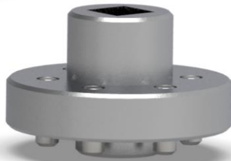
A6 Base Spanner For Installation of A6 Part Number: TM-C1040B