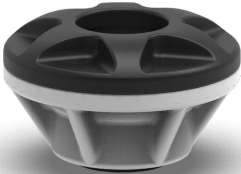
A6 Top Spanner For Installation of A6 Part Number: TM-C1040A

The A6 Pressure Relief Valve is ideal for any application where compactness and reliability are critical. The opening and closing pressures are accurately pre-set and repeatable.